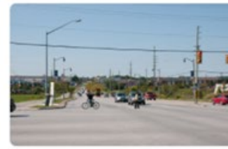
Ajax Active Transportation Upgrades