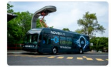
Brampton Transit Electric Buses