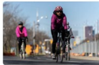
ActiveTO Bike lanes