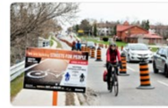
Brampton Active Transportation Upgrades