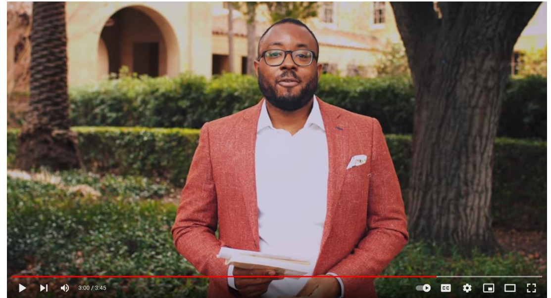
The History of Black History Month