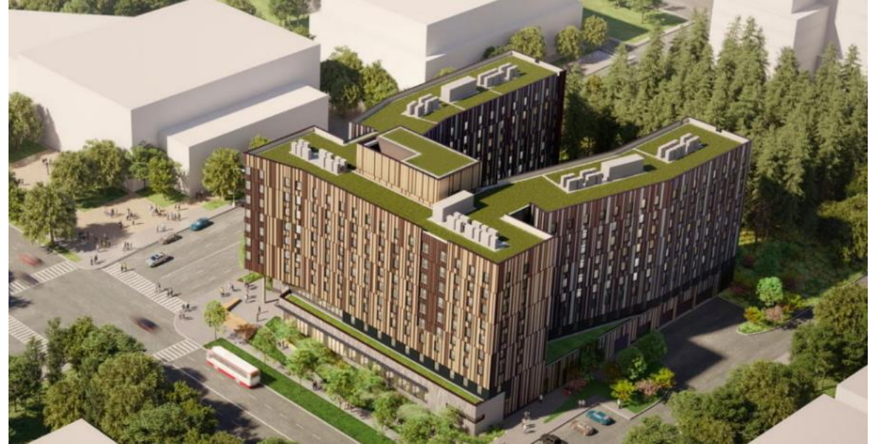
University of Toronto student residence, Under construction