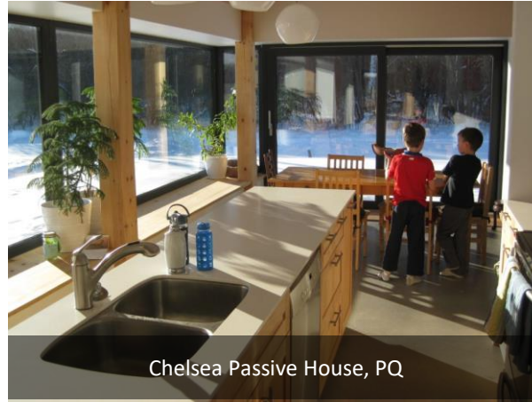
Chelsea Passive House, PQ