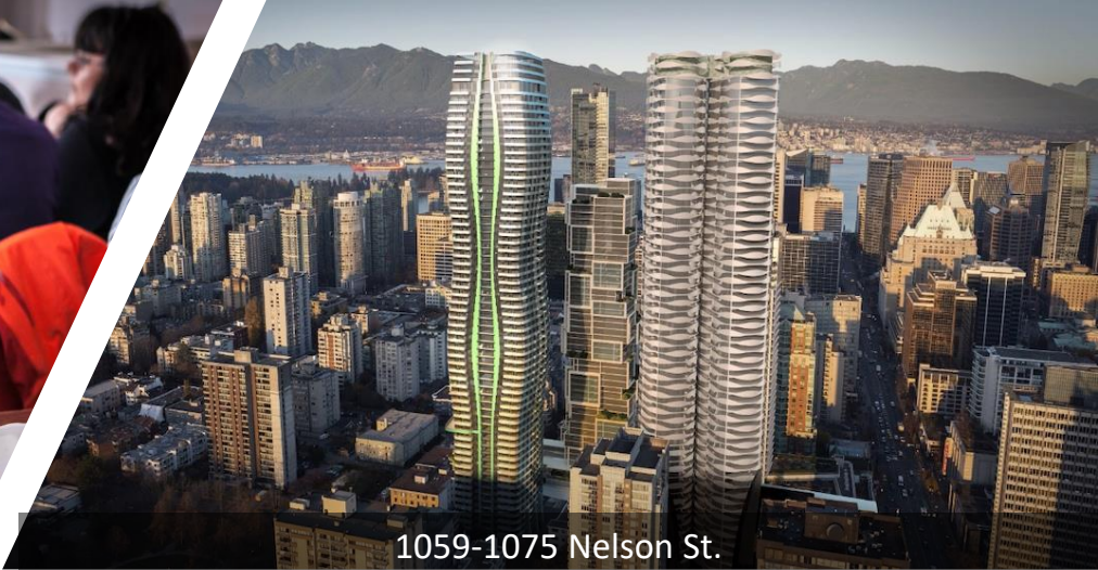
1059-1075 Nelson St.