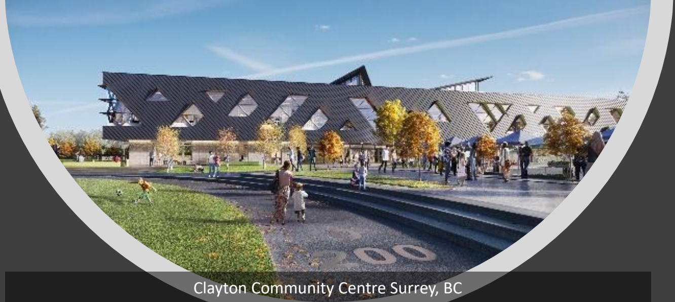
Clayton Community Centre Surrey, BC