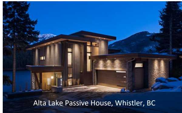
Alta Lake Passive House, Whistler, BC