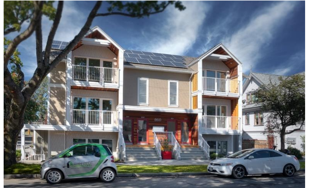
North Park Passive House 6-unit condominium Victoria, BC