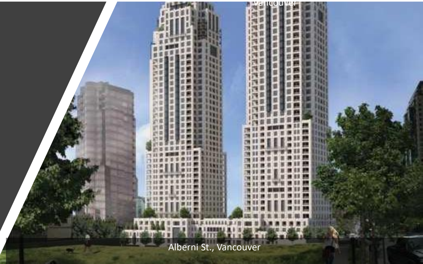
Alberni St., Vancouver