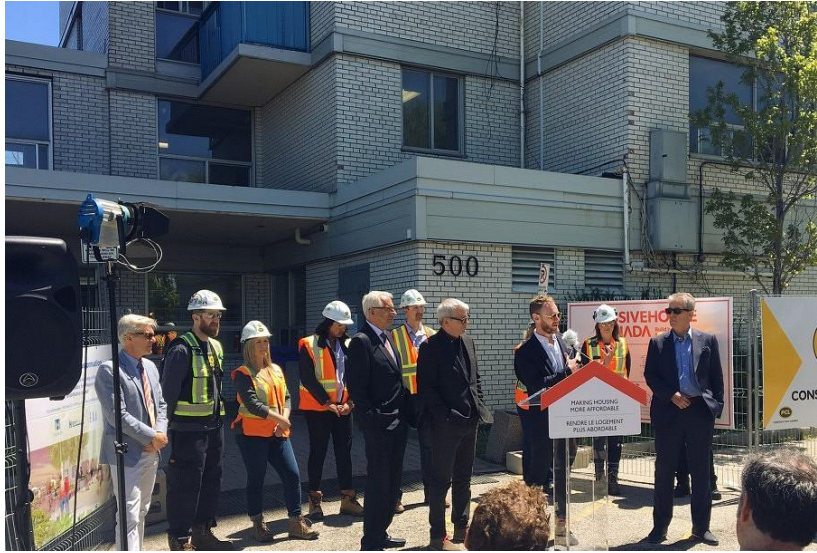
Ken Sobel Tower, Hamilton, ON