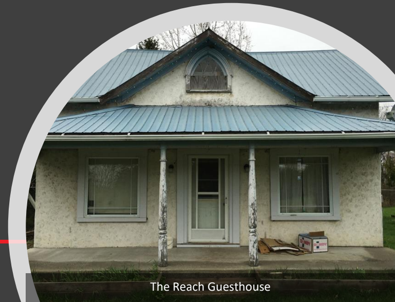
The Reach Guesthouse Prince Edward County, ON