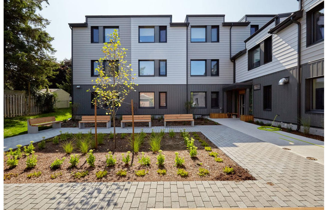
Blossom Park, affordable housing Oxford County