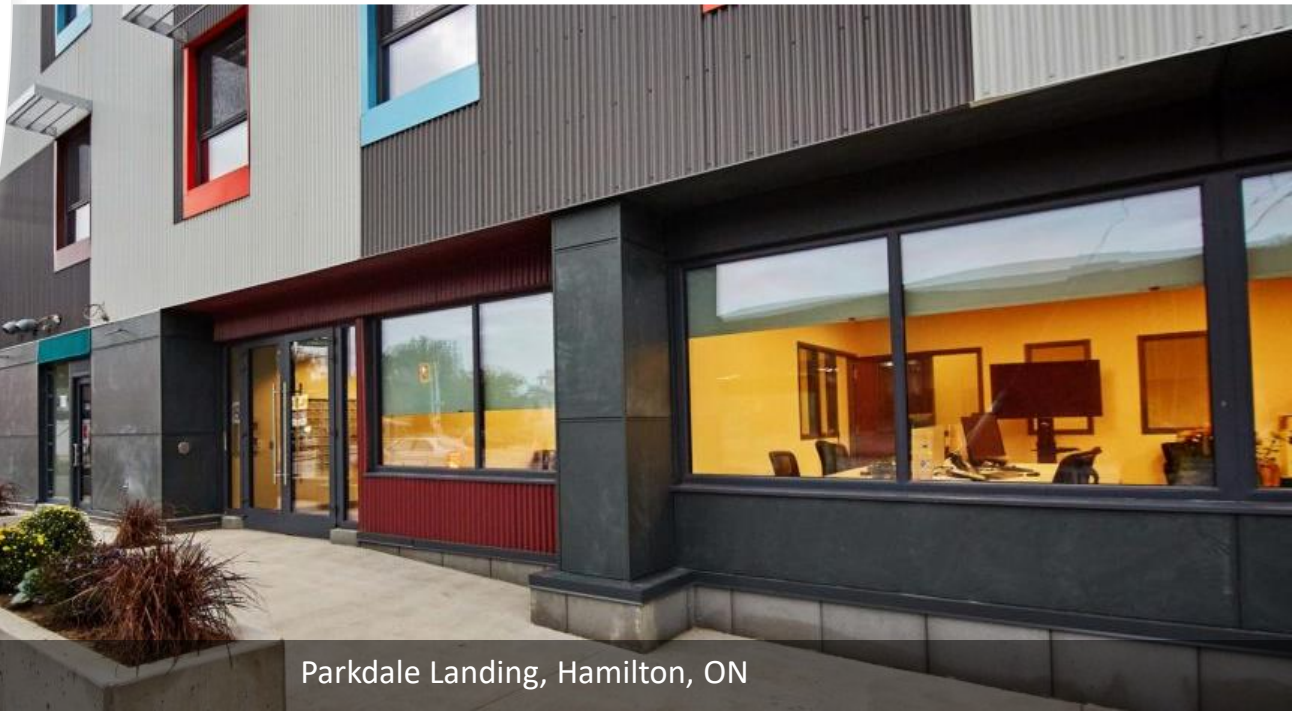
Parkdale Landing, Hamilton, ON