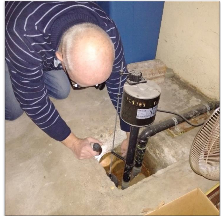
Assessor completing visual assessment of sump pit and pump