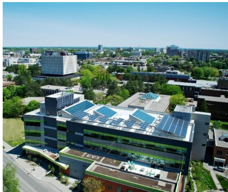
University of Waterloo Campus

*The Intact Centre operates independently of all funders and does not benefit from the sale of any products or services.