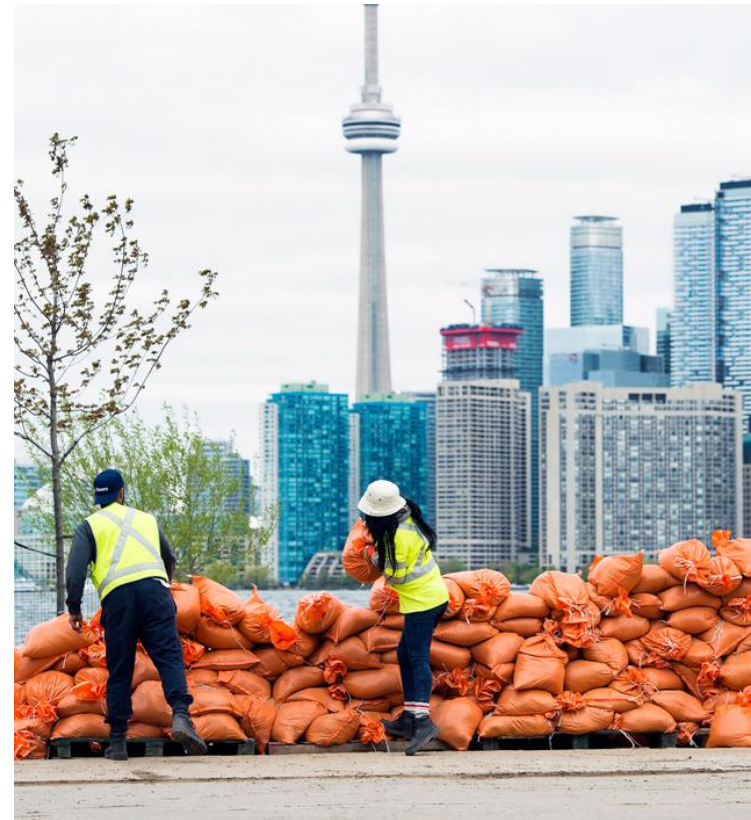
Toronto Island, 2017