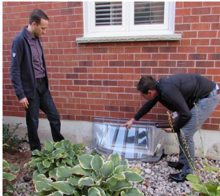
Assessor engaging a homeowner in a problem-solving conversation