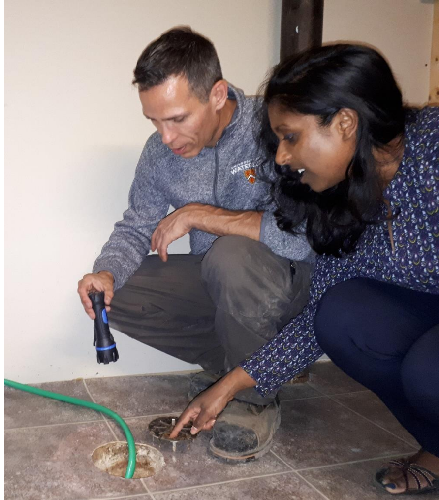
Assessor guides homeowner through detailed assessment