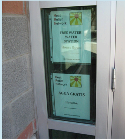
Signs for free water at a cooling center in Maricopa County, Arizona.

A cooling center (or “cooling shelter”) is a location, typically an air-conditioned or cooled building that has been designated as a site to provide respite and safety during extreme heat. This may be a government-owned building such as a library or school, an existing community center, religious center, recreation center, or a private business such as a coffee shop, shopping mall, or movie theatre. Some counties have set up cooling sites outdoors in spray parks, community pools, and public parks. Sometimes temporary cool spaces are constructed for events such as a marathon or outdoor concert.